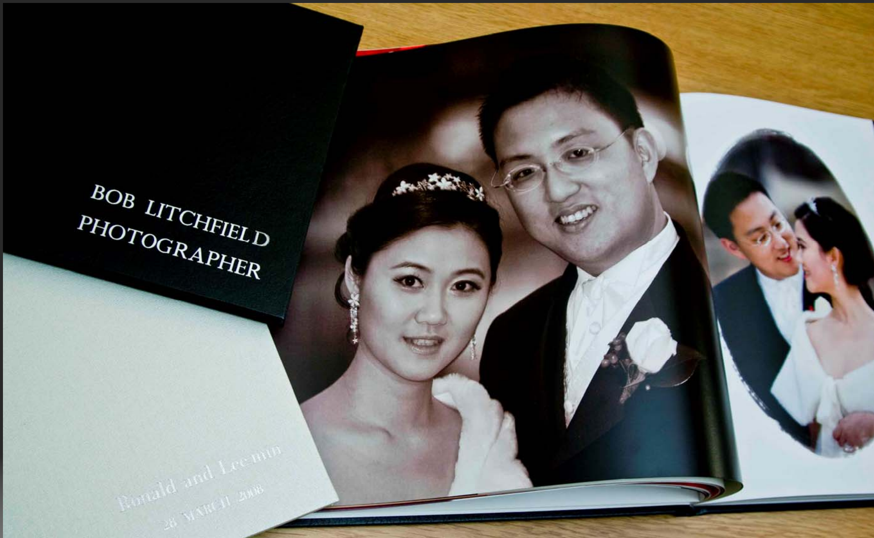
Sample of Wedding Book